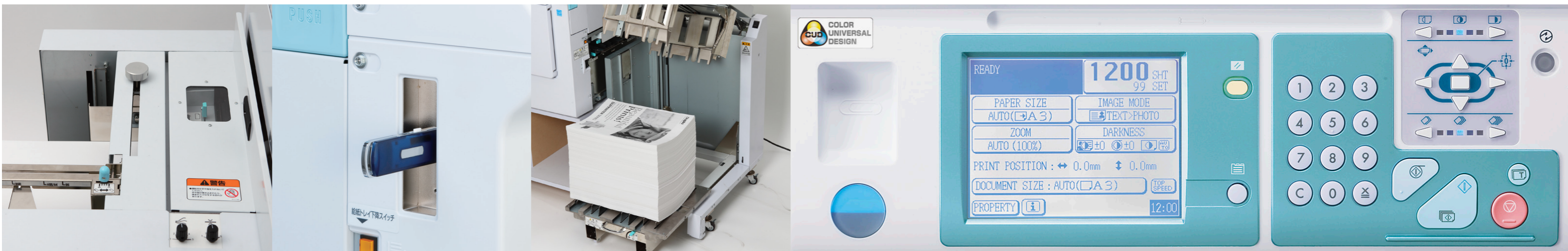
Unique suction feeder

Changing the print position is very simple. The directional arrows on the control panel allow the user to move the image even when printing!