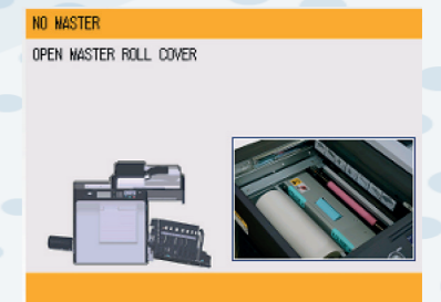
Consumable alarm message